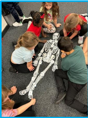
Room 4 – Skeleton and Bones