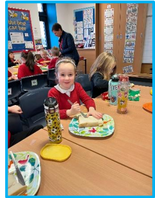
Room 3 – Sandwich making