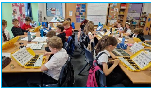
Room 8 – Reading music and performing