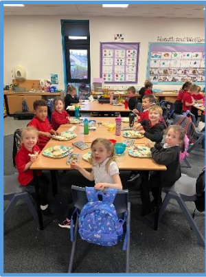
Room 1 – Sandwich making