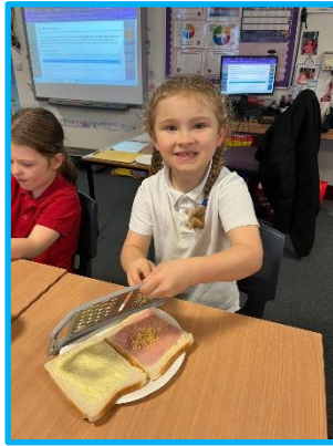
Room 2 – Sandwich making