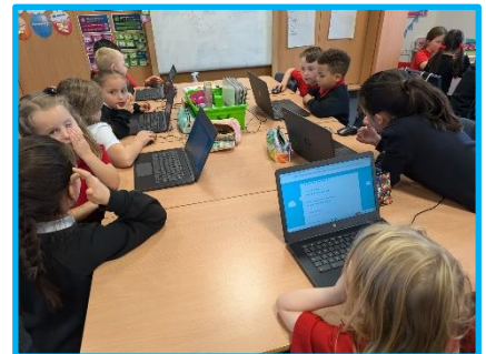
Room 7 – Joint learning with Room 1